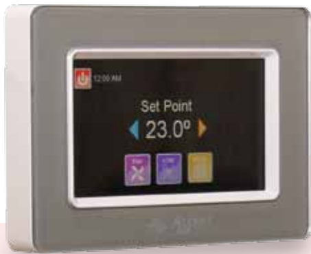
LCD Wall Controller