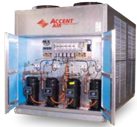
Pool Heat Pump